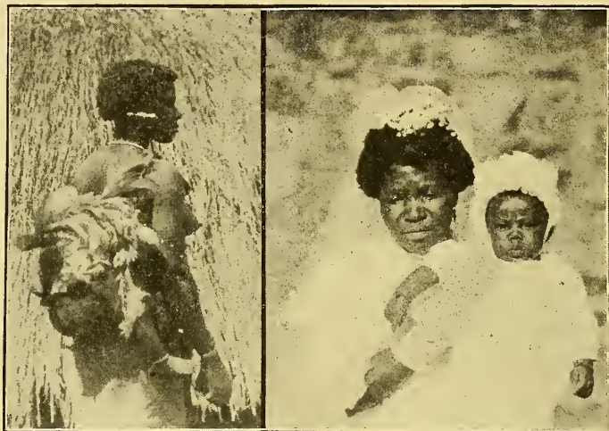
A CONTRAST IN AFRICAN CHILDHOOD

Outside, the chief questioned her: "What was the magic she had used? A teakettle? Was she a teakettle witch?—a smoke spirit?—what?" She disclaimed so much title with signs and many pointings and occasional interpretations on the part of her bearers. "No, she could not spare her teakettle—or the heater, but she happened to know of a wonderful white witch doctor who was provided with both these articles. Should she send her to the chief?" The chief consented. "The white witch doctor might come, but the teakettle must come too."